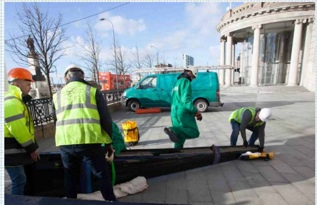
Above: The team from Skyline Abseil Access