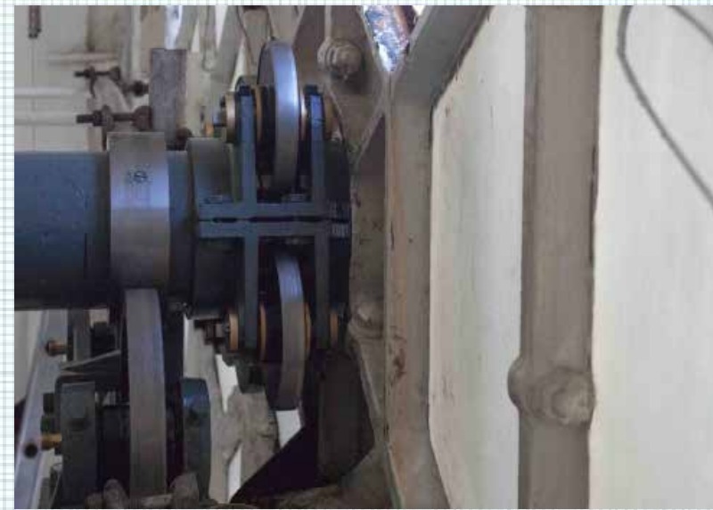
Left and below left: The opening in the dial was just large enough!